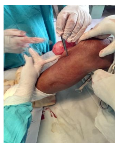
Fig.3: Swelling in the antero inferior aspect of Knee joint.

DOI: 10.9790/0853-14181214 www.iosrjournals.org 13 | Page