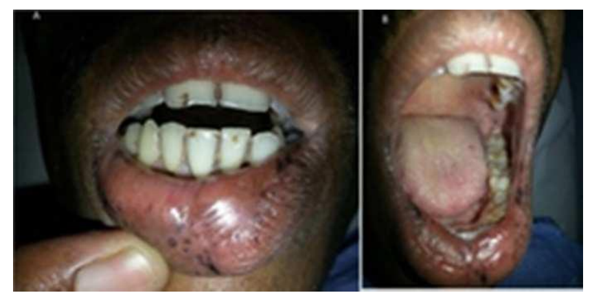
Figure 1: hyper pigmented patches along the mucocutaneous junction of lips