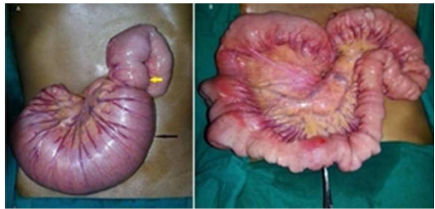
Figure 3: Intraoperative image shows distal jejuno-jejunal intussusception (picture A) (yellow arrow indicates intussusceptum and black arrow indicates intussuscipiens) and lead point shown by artery forceps (picture B) indicates intussuscipiens.