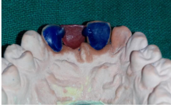
Fig. 5- Wax pattern for the RBD.