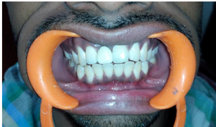
Fig. 7- RBB cemented; Notice the anterior open bite in the patient.