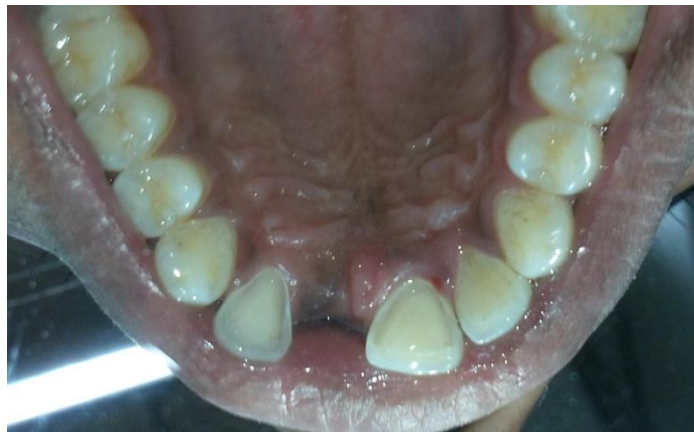
Fig. 3- Intra-enamel preparation for RBD.