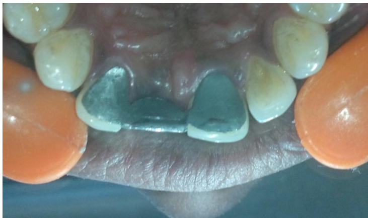
Fig. 6- Framework trial.