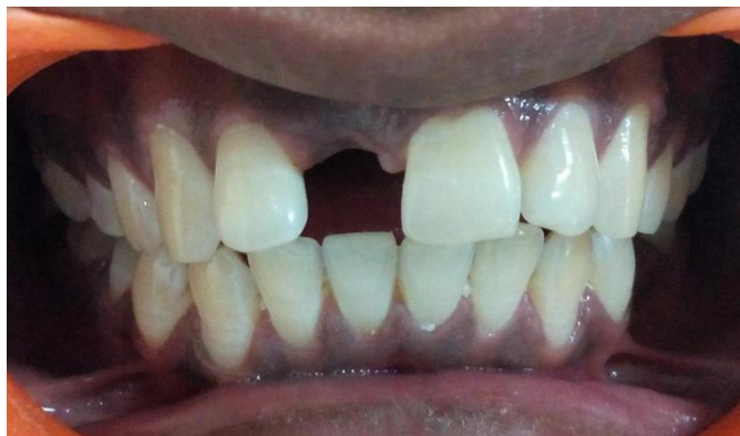
Fig. 1- Missing maxillary right central incisor, an aesthetically critical edentulous space.

Fig. 8- The patient satisfied with aesthetic results of the RBD.