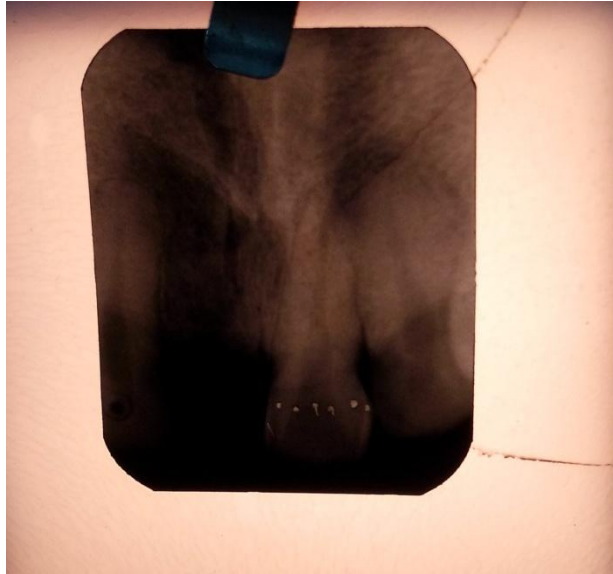
Fig. 2- Radiograph depicting a large pulp cavity in a young patient, a contra-indication for complete coverage FPD.