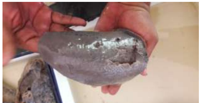
Fig:6. Showing absent fissure

The length of oblique fissure ranged from 26 cm(max) to 13 cm(min) on the right side .The length of fissures on the left side was ranging from 28 cm(max) to 8 cm(min). The length of transverse fissure on the right side was ranging from 18 cm to 4 cm. The accessory fissures are about 3 cm to 1 cm in length. The right lobe showed 3 lobes and left lobe showed 2 lobes.