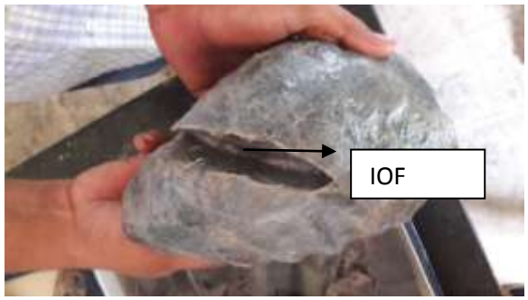
Fig:4. Showing Incomplete oblique fissure

The left lung showed incomplete oblique fissures in 7 lungs (28%)Fig.4 and complete oblique fissures in 11 lungs (44%)fig 5. The oblique fissure was absent 3 lungs (12%).Fig.6.