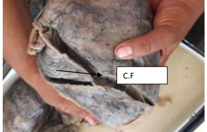
Fig:3. Showing complete fissures

The left lung showed incomplete oblique fissures in 7 lungs (28%)Fig.4 and complete oblique fissures in 11 lungs (44%)fig 5. The oblique fissure was absent 3 lungs (12%).Fig.6.