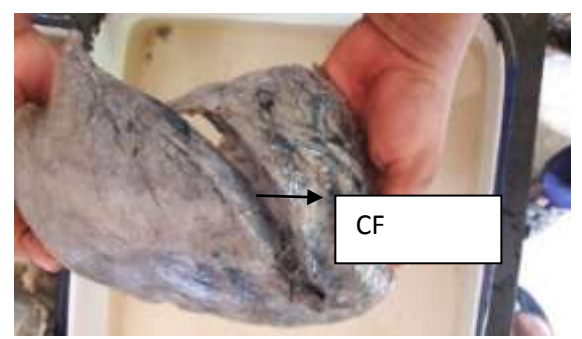
Fig.5:Showing complete fissure