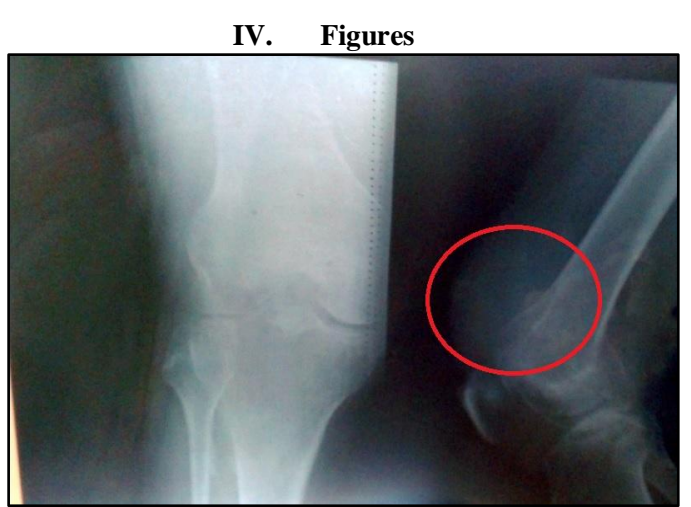
Figure 1:Roetgenogram showing a soft tissue mass at the lower end of left femur near the knee joint.