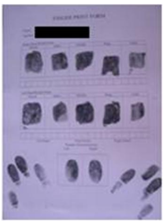
Figure 3 R • R · w w -• w -• w -• w · w • 142 A: ARCH T: TENTED ARCH R: RIGHT LOOP PATTERN ABBREVIATIONS:- W: WHORL S:SCAR L:LEFT LOOP N: NONE