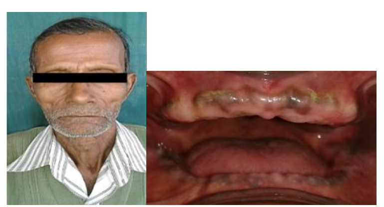
FIG 1FIG 2