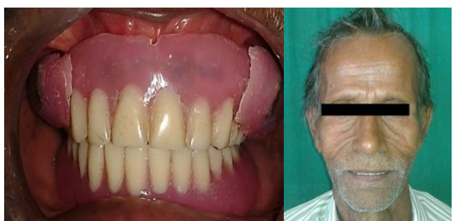
FIG 15FIG 16