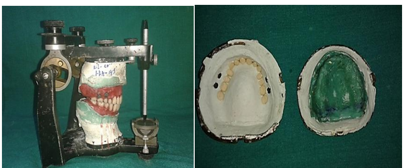
FIG 7 BFIG 8