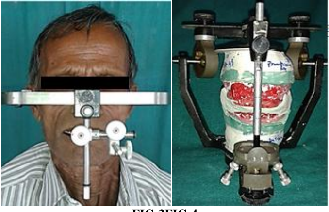
FIG 3FIG 4