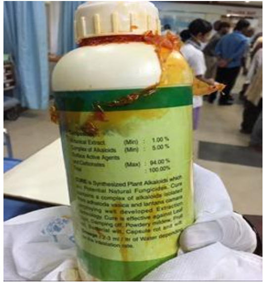
Actual Biofungicide agent consumed by the patient

Our patient had consumed Biofungicide which contains plant alkaloids in a suicidal attempt. In the above mentioned case, our patient had developed pale peripheries and had bluish discoloration of blood. With an index of suspicion, after ruling out other poisonings, methemoglobinemia was diagnosed and treated. Methemoglobin is generated by oxidation of the heme iron moieties to ferric state, causes bluish-brown muddy color resembling cyanosis. It has got very high affinity to oxygen and oxygen is not delivered to the tissues (oxygen dissociation curve shifted to the left). It is suspected in patients with hypoxic symptoms who appear cyanotic but have a sufficiently high PaO<sub>2</sub>. Muddy appearance of freshly drawn blood is a critical clue for diagnosis.[2] Normal Meth-Hb levels are <1%. The physiologic reduction of MethHb Fe3+ to Hb Fe<sub>2</sub>+ is mainly accomplished by red cell NADH-cytochrome b5 reductase.