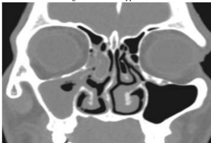
Figure 2: bulbous type CB