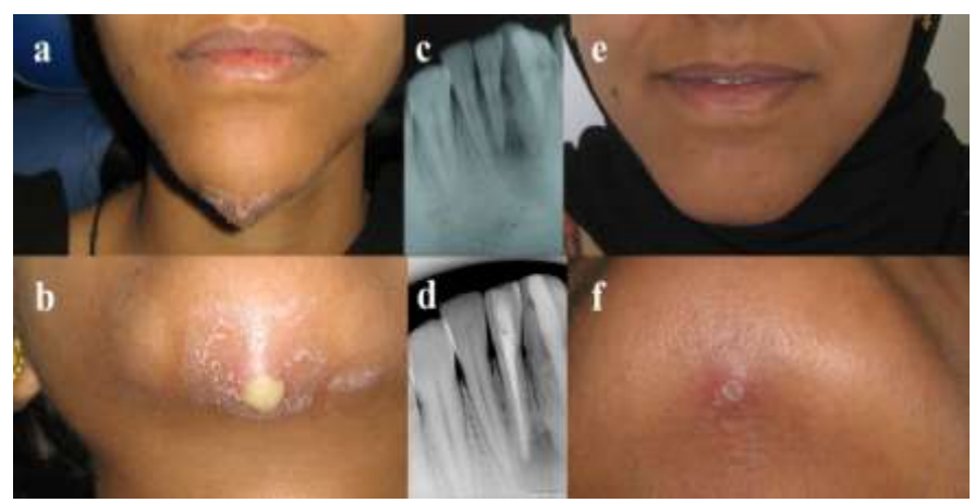
Figure 2 (a) & (b) Clinical examination showed an ulcer with draining sinus in submental area; (c) pre operative radiograph; (d) post operative radiograph; (e) & (f) post operative photographs showing satisfactory healing.

operative radiograph; (e) post operative photograph showing good healing except scar tissue; (f) complete healing after surgical aesthetic correction.