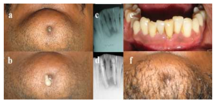
Figure 3 (a) Clinical examination showed nodular swelling with sinus in submental area; (b) on palpation, pus discharge was evident (c) pre operative radiograph; (d) post operative radiograph; (e) intraoral examination revealed slight discoloration of teeth number 31 & 42; (f) post operative photograph showing satisfactory healing.