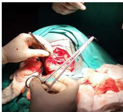
Intra-Operative Image Preserving Viable Brain Matter