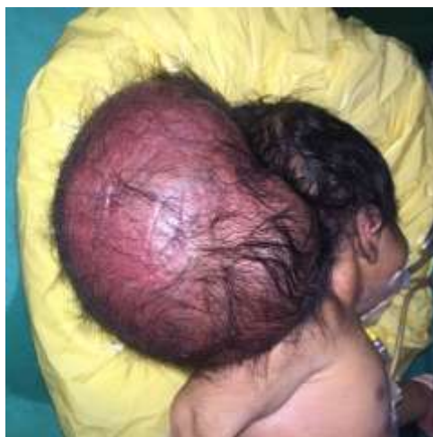
Pre-Operative Image Showing Giant Occipital Encephalocele

A 3 days old male baby presented with a swelling over the occipital region since birth. The baby was born at 37 weeks of gestation by caesarean section with a birth weight of 3100 gms. There was no abnormality on physical examination except for a large cystic mass in occipital region. The mass was larger than the size of the head. Routine hematological and biochemical investigations were normal. Computed tomography of head revealed occipital bony defect of size 14 mm with evidence of meningo-encephalocele and herniation of cerebellum into the upper cervical region with moderate hydrocephalus.