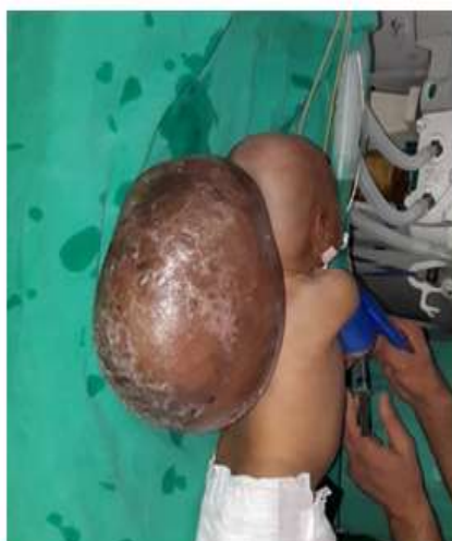
Pre-Operative Image Showing Giant Encephalocele

A 19 days female baby came with swelling over the occipital region since birth. The baby was born out of 36 weeks of gestation by caesarean section with a birth weight of 3800 gms. The swelling was larger than the size of head. No any other abnormality detected. Neurological examination was normal. Magnetic resonance imaging revealed 16x14 mm defect in occipital bone with occipital encephalocele along with brainstem kinking, descent of sinus confluence and small posterior fossa. Surgery was planned. Patient was intubated in left lateral position. Sac was opened. Gliosed part was excised taking in care of sinus to be preserved. Redundant skin and sac was excised. Closure was done in layers. Patient tolerated the procedure well and was discharged on post-op day 8.