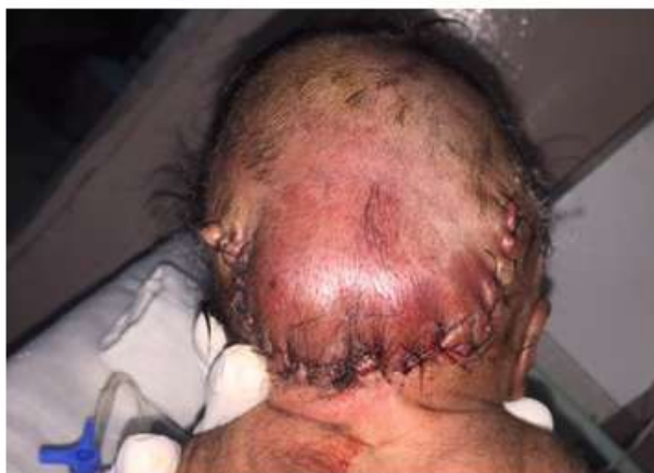
Post-Operative Image After Excision Of The Encephalocele And Closure Of Skin

Magnetic resonance imaging revealed 18x16 mm defect in occipital bone with occipital encephalocele along with brainstem kinking, descent of sinus confluence and small posterior fossa with altered configuration of bilateral lateral and 3 rd ventricles. Surgery was planned. Occipital swelling was first canulated with a wide bore needle and around 900 ml was drained out gradually. Patient was then intubated in left lateral position.