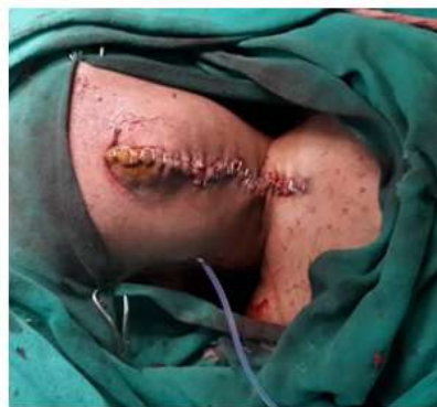
Post-Operative Image After Closure