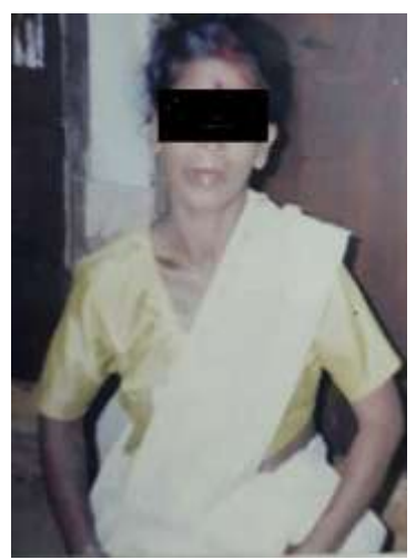
Figure 5: Allergic rashes due to Carbamazepine