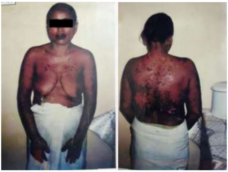
Figure 4: Steven Johnson Syndrome