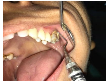
Figure 3: Subgingival plaque sample collection in CGP patients.