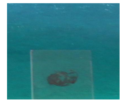
Figure 7: Smear stained with gram stain prepared for gram