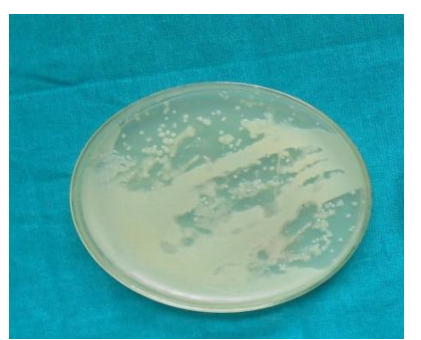
Figure 6 : Colonisation of MS under specific aerobic condition.