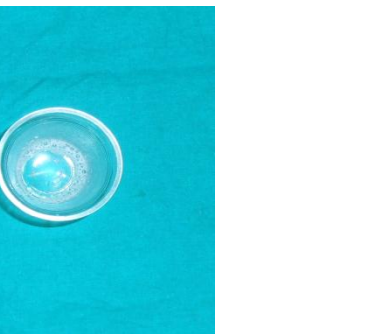
Figure 5: TYCSB agar with bacitracin culture media.