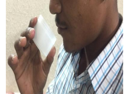
Figure 1: Saliva sample collection