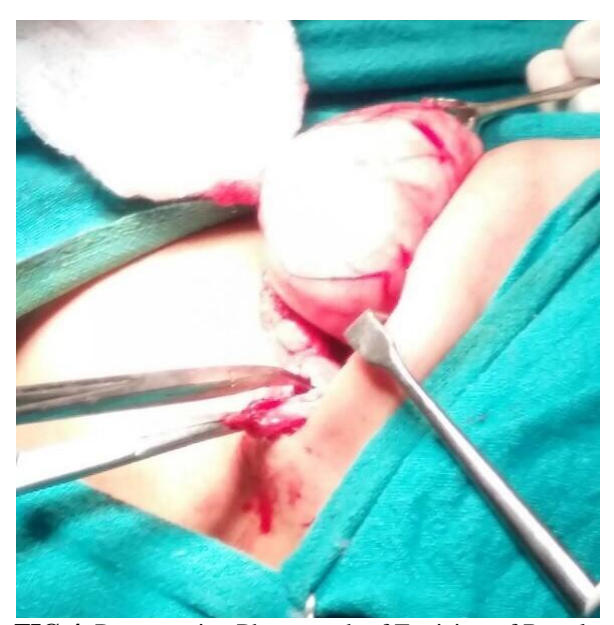
FIG 4. Peroperative Photograph of Excision of Ranula