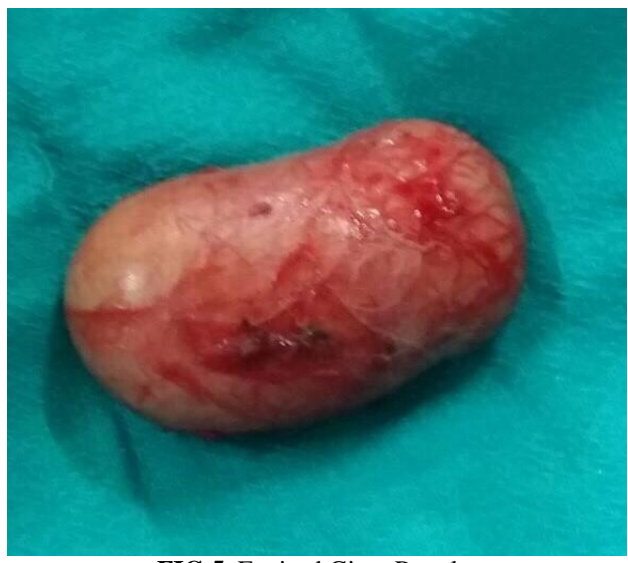
FIG 5. Excised Giant Ranula