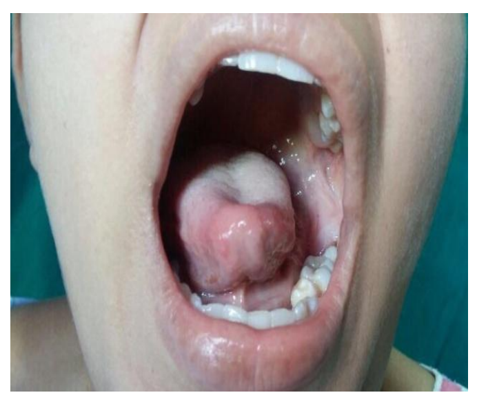
Fig1. Oral View Of Plunging Ranula