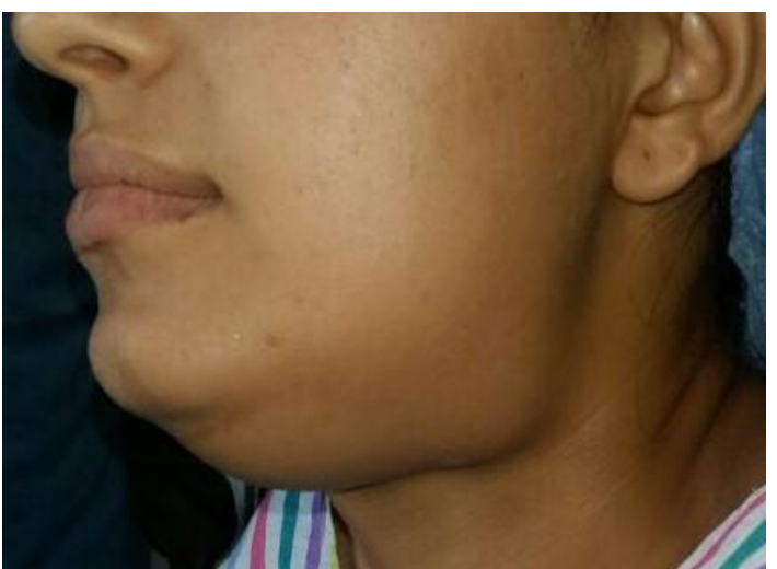
Fig 2. Extra Oral View Of Plunging Ranula