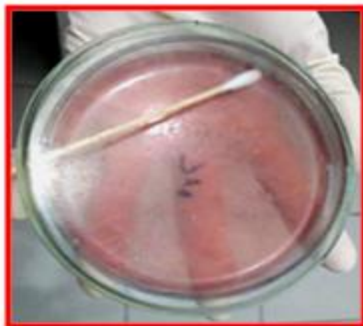
Figure 3. The swab was immediately applied to MacConkey agar culture media.