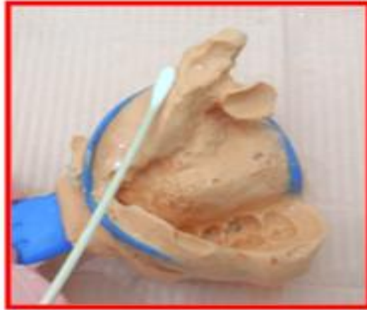
Figure 2. The surface of impression on defect area was swabbed with dry sterile cotton swab for 30 seconds.

after 60 minutes. The surface of cast on defect area was swabbed with dry sterile cotton swab for 30 seconds (Figure 4). The swab was immediately applied to MacConkey agar culture media for microbiological sampling. The swab of the samples was incubated aerobically at 37°C for 24 hours. After 24 hours of culturing, one colony among this culture was selected for the staining purpose and biochemical testing in identification process.