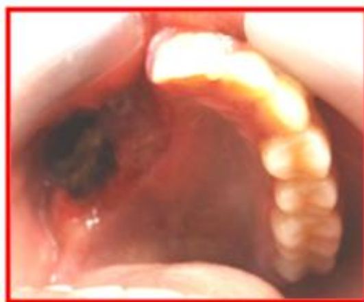
Figure 1. Defect in maxillary arch of post hemimaxillectomy patients

The study was conducted in accordance with a protocol approved by the Ethical Committee of Faculty of Medicine University of Sumatera Utara, and informed consent was obtained from all subjects. The subject included 4 adults, randomly selected from the patients of the Department of Prosthodontics at Dental Hospital University of Sumatera Utara, with the following inclusion criteria: (1) post hemimaxillectomy minimum of 2 weeks, (2) defect in the maxillary arch (Figure 1), (3) good general health, and (4) consist of Klebsiella pneumoniae on impression. Exclusion criteria were (1) swelling and bleeding, (2) received antibiotic treatment and (3) radiation therapy.