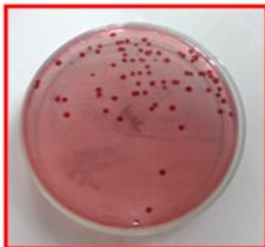
Figure 5. K. pneumoniae colonies on MacConkey agar culture media.

The results were recorded, analyzed and compared with the control and were subjected to statistical analysis.