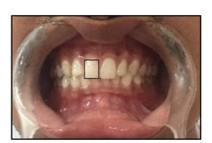
Fig 3b: Tooth form outline traced