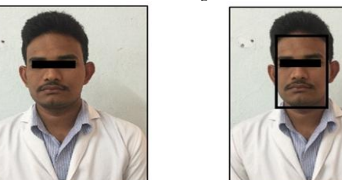
Fig 3a: Facial outline traced