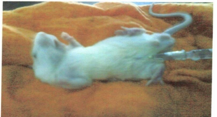
Figure 1: Intraperitoneal injection of drug in Mice

Statiscal analysis: Statistical analysis done in MS OFFICE Excel (2007) by applying one way ANOVA (Data analysis) and calculated the significance of drug. P value <0.05 indicates significant.