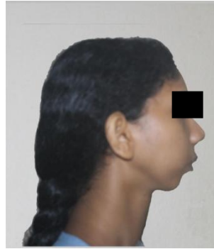
Figure 1: Pre operative lateral profile view