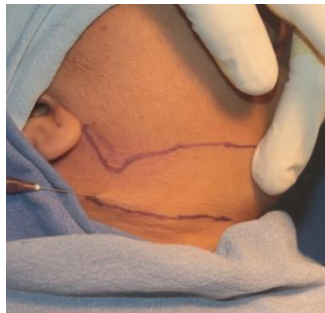
Figure 2: Incision marking for Risdon's approach