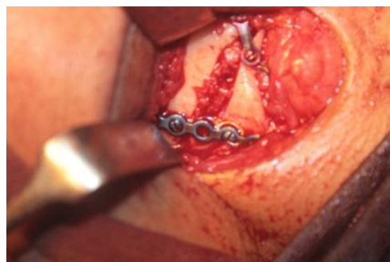
Figure 4: Interpositional bone graft placement and miniplate fixation