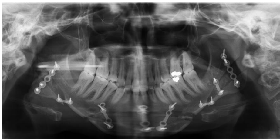
Figure 7: Post operative OPG