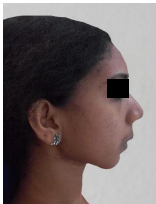
Figure 5: Post operative lateral profile view