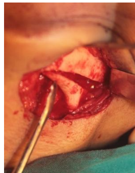
Figure 3: Mandibular angle osteotomy