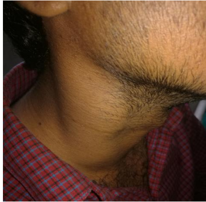
Fig 1- Pre-Op picture showing lymph node enlargement at level 2 station on the right side of the neck.