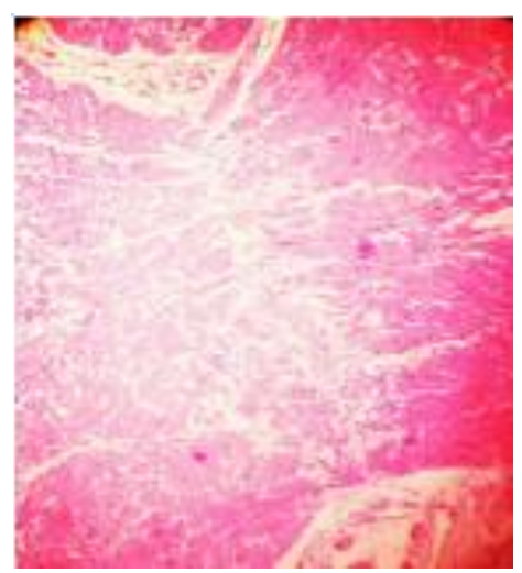
Fig -2: Intestine showing hypertrophied nerve bundles