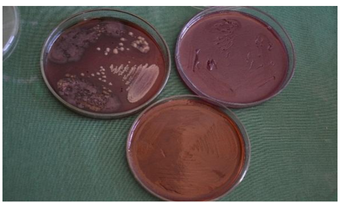
Fig 2:- Photograph showing Microbial growth in culture media