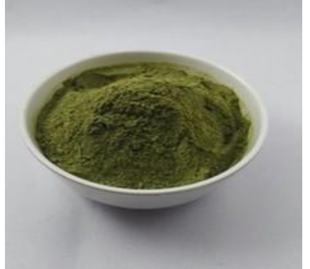
Fig 4: Neem twig powder