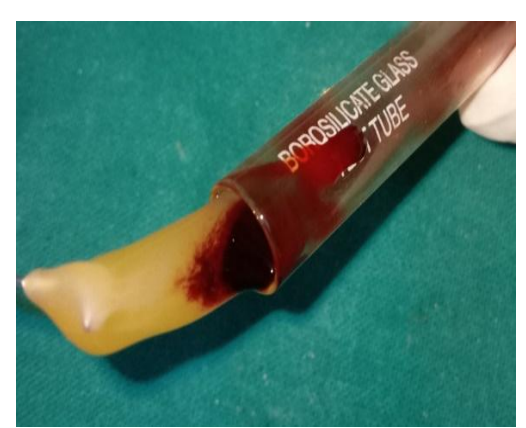
Figure3: Preparation of Platelet Rich Fibrin (PRF)