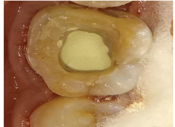
Figure8: MTA placed at sub pulpal floor