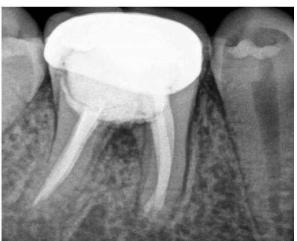
Figure10: 6 month follow up