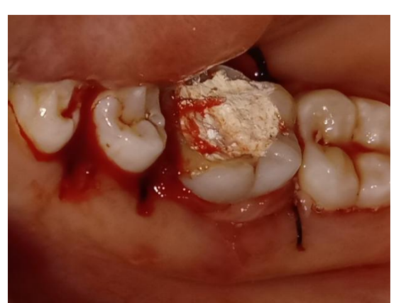
Figure7: Post surgical site