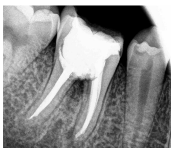
Figure9: 3 months follow up