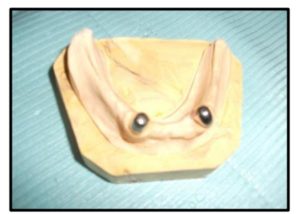
Figure 1: Cast with metal coping on master model

Also, all evaluated measurements were recorded for the mandibular bone height as the reference sites (Midline - anterior canine (FC) – first premolar (FP) and first molar (FM) and mental foramen line (ALC-MF-IBM)). (Figure 1-4)