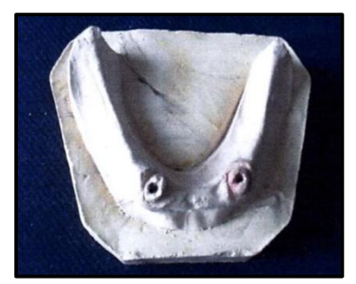
Figure 2: Cast for metal coping with root canal post preparations