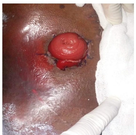
Figure 4 - following slough excision