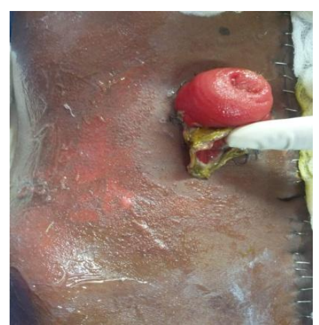
Figure 3 - superficial necrosis with mucosal slouging