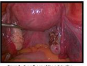
Figure 7 : Overall view of the pelvis after partial oophorectomy