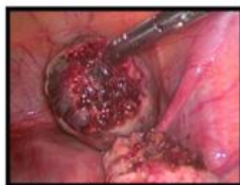
Figure 4 : Perfect haemostasis