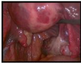
Figure 1 : Healthy appearance of both fallopian tubes