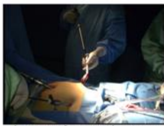
Figure 6 : Extraction of the specimen through the left trocar port