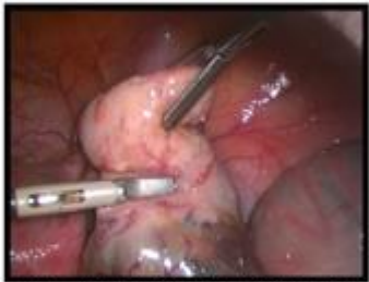
Figure 3 : Partial oophorectomy by thermofusion