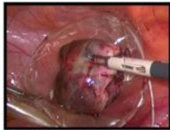
Figure 5 : Surgical part placed in an endobag