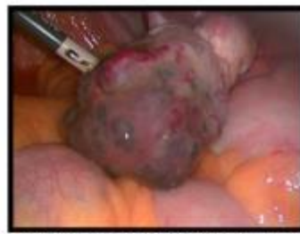
Figure 2 : Hypervascularised right ovarian tumour mass