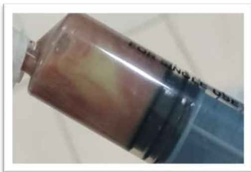
Fig 2: Fnac revealing thick yellow fluid.