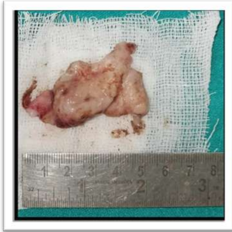
Fig:7 Enucleated lesion