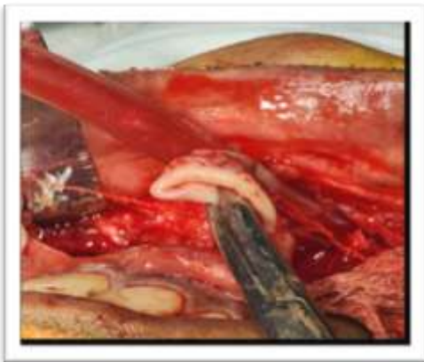
Fig:4,5,6 Intra-operative pictures