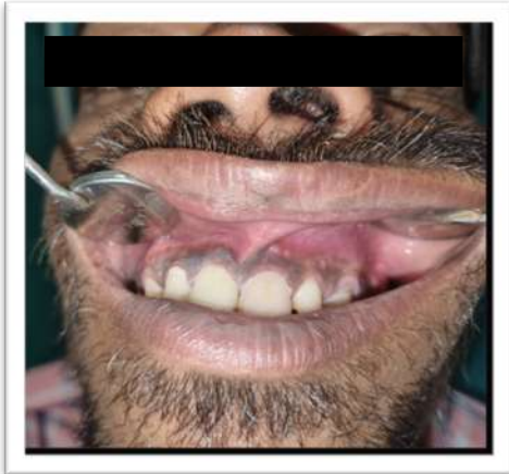
Fig:1 Pre-operative picture depicting intraoral lesion.

10. Agani, Z., Hamiti-Krasniqi, V., Recica, J. et al. Maxillary unicystic ameloblastoma: a case report. BMC Res Notes 9, 469 (2016). https://doi.org/10.1186/s13104-016-2260-7