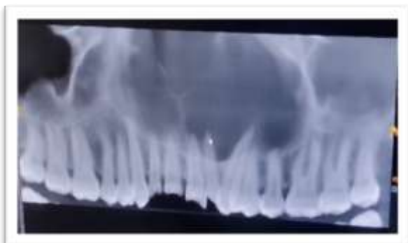
Fig: 3 Cbct of maxilla depicting large lesion shown with arrows