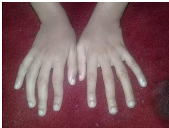
Figure 3 : Arachnodactyly

Genetic counselling had also been offered to the parents.