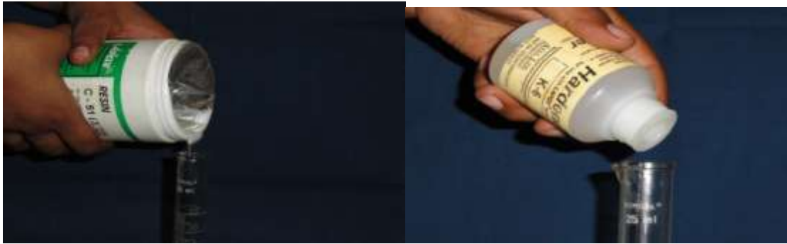
Figure 4:- Resin and hardener dispensed to the beaker.