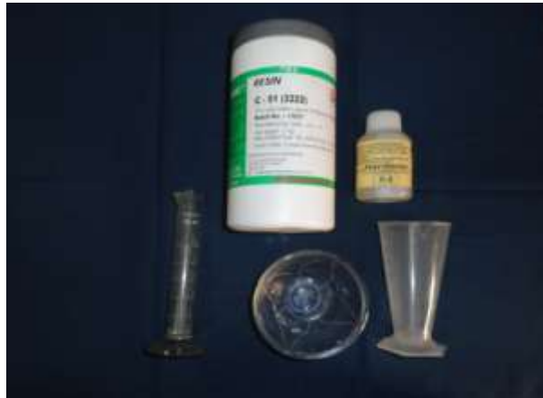
Figure 1:- Armamentarium for study