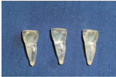
Figure 7:- Photoelastic model of tooth.