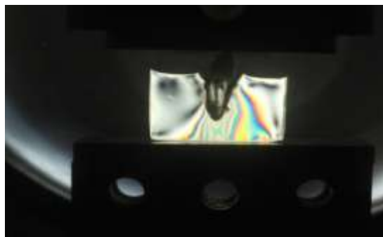
Figure 9:- fringes are appreciated in the model.