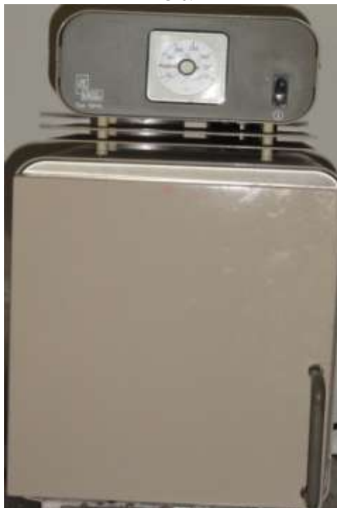
Figure 6:- Preheating unit.