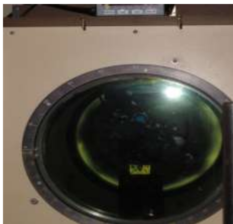
Figure 10:- photoelastic bench with the model.