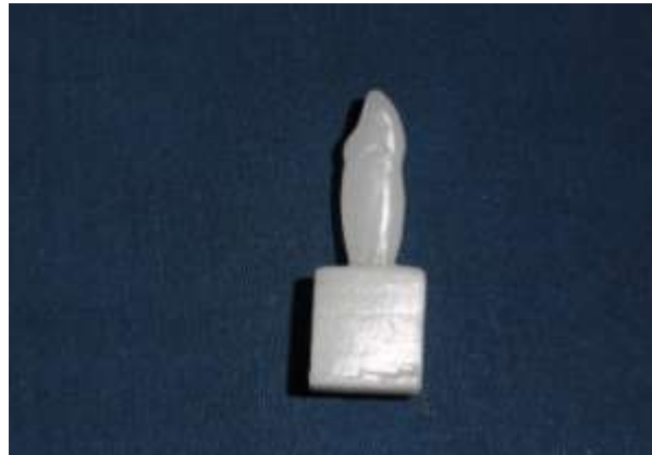
Figure 2:- Wax model of maxillary central incisor.