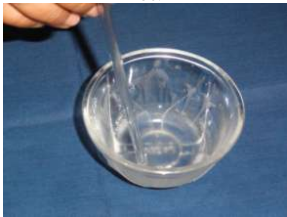
Figure 5- Mixing of epoxy resin.