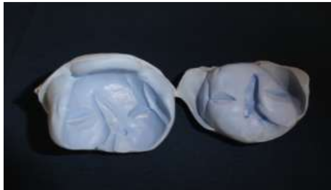
Figure 3:- putty mould of the tooth.