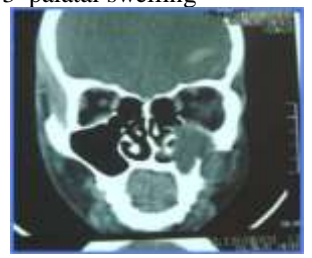
Fig 4 CT Scan showing bone resorption