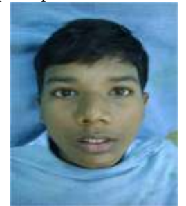
Fig 8 post operative view-face