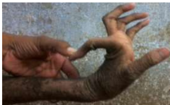
Fig: 4 Showing Hyperlaxity of the metacarpo-phalangeal & proximal inter-phalangeal joints.