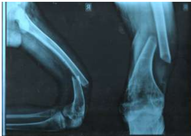
Fig: 5 Pathological fracture of Rt. shaft femur.