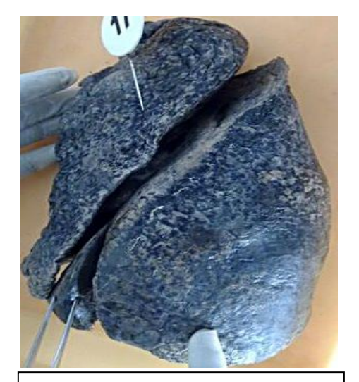
Fig: 5 Extra lobe in between the two lobes in the left lung