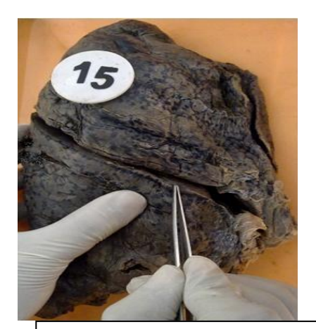
Fig :1 Absence of Transverse (or) Horizontal fissure in right lung