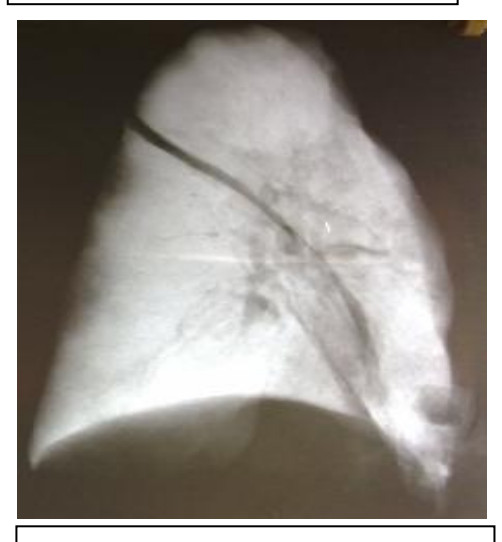
Fig:8 Radiological view of the Fig:7