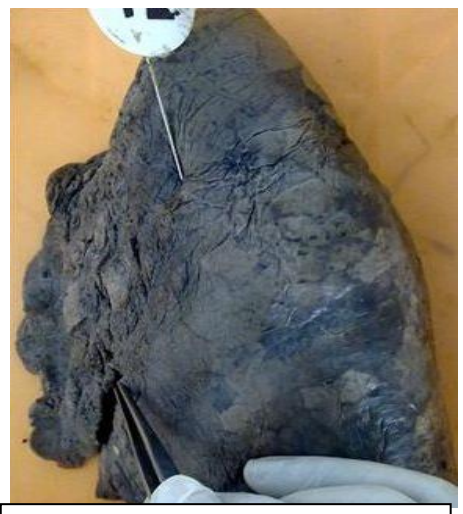
Fig: 6 Incomplete oblique fissure in the left lung