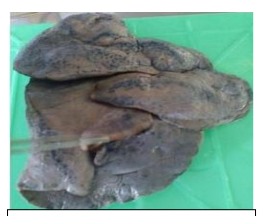
Fig: 3 In right lung inferior lobe showing an accessory lobe.