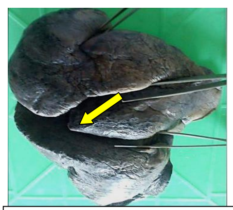
Fig: 4 In right lung inferior lobe showing accessory fissure.