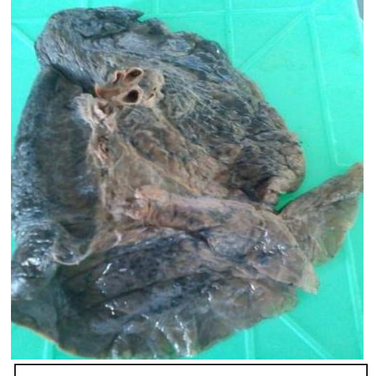
Fig: 9 below the lingula an extra projection in the left lung