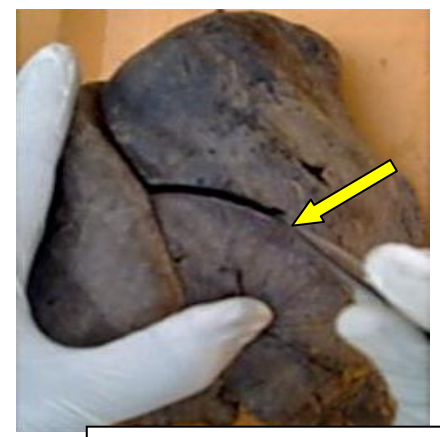
Fig: 2 Arrow showing incomplete transverse fissure in the right lung