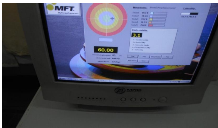
Fig.4 Balance Board Score