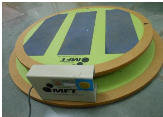
Fig.1 MFT Balance Board

2.3 Procedures: 20 individuals (10 males, 10 females) were stand on MFT balance board. Individual was made to stand in the Electronic Balance Board and the computer screen was kept in front of him for giving biofeedback and was trained for forward, backward and sideways balance training (Fig.2, 3). At the end of training, his score was displayed in the screen & recorded for 30, 45, 60 seconds (Fig.4). Training was given for 30 minutes once/ week for 6 weeks.