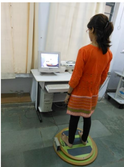
Fig.2 Forward & backward Balance training-Female