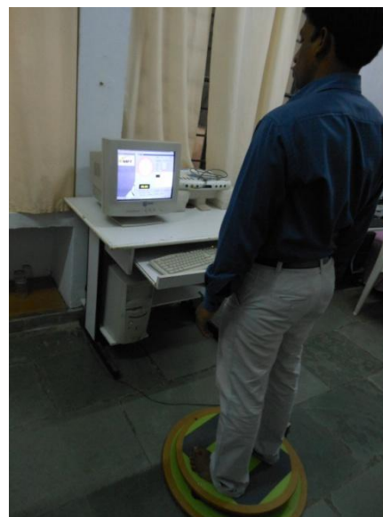
Fig.3 Sideways Balance training-Male