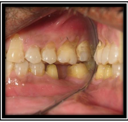
Fig.7- Prepared abutments with supragingival chamfer finish line to receive metal retainer.