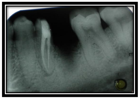
Fig.6- Mesial half of mandibular first molar with adequate bone support