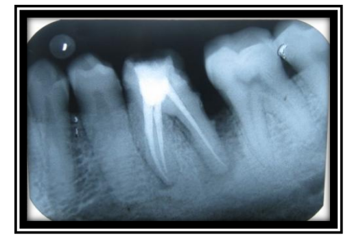
Fig.2- Bone loss on the distal aspect and radiolucency in the furcation area