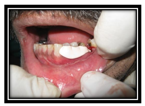
Fig.5- The surgical site covered with a periodontal dressing .