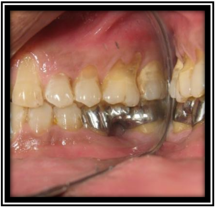
Fig.8- All metal bridge cemented in place.