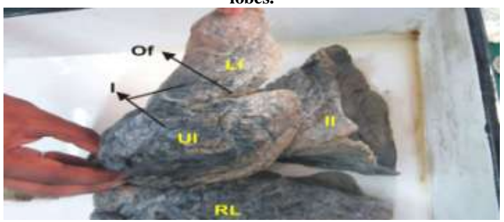
Fig- 2: Showing an incomplete oblique fissure dividing the anterior lobe of left lung in to upper and lower lobes.

I- Anterior lobe of left lung; II- Posterior lobe of left lung; Of- Oblique fissure; UL- Upper lobe; LI-Lower lobe.