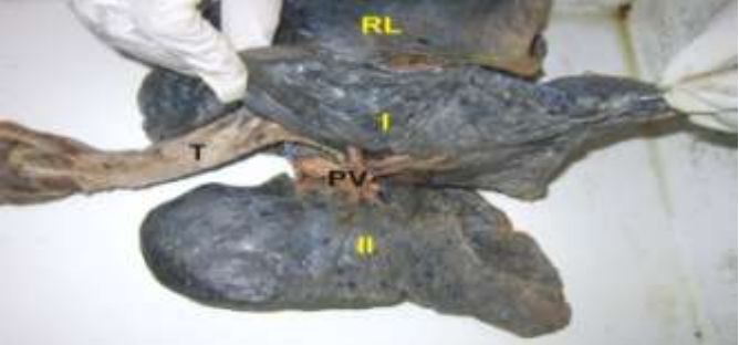
Fig- 1: Complete accessory vertical fissure dividing the left lung into anterior and posterior lobes