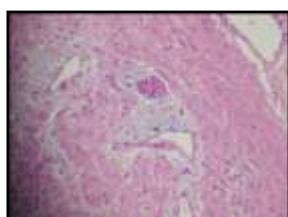
Fig 3. An odontogenic nest can be seen in the myxofibrous stroma.