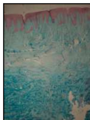
Fig 6. Alcianophilic stroma in the deeper connective tissue

Histopathologically, the lesions showed few nests, strands and rests of odontogenic epithelial cells (Figure 3) scattered in a mature fibrous stroma interspersed with few areas of myxomatous tissue. The deeper connective tissue showed predominantly myxomatous tissue (Figure 4) exhibiting relatively less cellular, loosely arranged tissue dominated by an amorphous, irregular ground substance with spindle and stellate-shaped cells (Figure 5). The alcianophilic of the myxoid component is well demonstrated with the alcian blue staining (Figure 6). Keeping all the clinical and histopathological findings in mind, a diagnosis of peripheral odontogenic fibromyxoma was made.