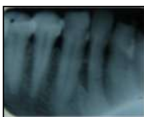
Fig 2. Faint radiolucency in the lateral incisor-canine region.