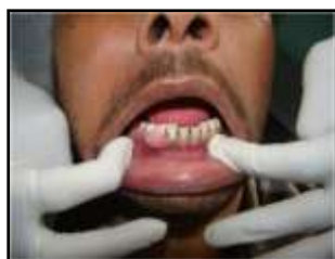
Fig 1. A fibrous growth can be seen in the lateral incisor-canine region.