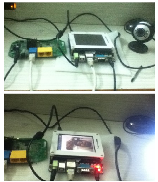
Figure: experimental set-up implementation.

With the continuous progress of CMOS technology, CMOS image sensors are more and more high resolution, low-cost, small size and easy programming, its application will become increasingly widespread. In this paper, the method of designing the CMOS camera driver based on S3C2440 developing board and Image acquirement in embedded linux is realized.