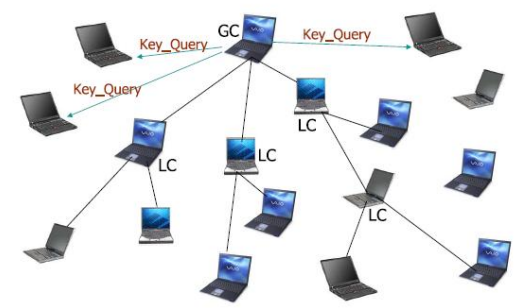
Figure (1): The group key generation and distribution in Enhanced BAAL.

The Enhanced BAAL protocol [5] is based on the combination of the BAAL protocol which is a group key management protocol in wired networks, and the dynamic support offered by the Adaptive Key Management Protocol (AKMP) protocol [6]. Authentication and key generation are achieved via threshold cryptography [7] as shown in figure (1). Each entity of the group holds a public and a private key, generated by the server nodes of the threshold cryptography. The principal actors of this architecture are the global controller (GC), the local controllers (LCs) and the members of the multicast group. The GC is the source of the multicast group, and is responsible for the generation, distribution and periodic renewal of the TEK. The GC combines the contribution of threshold cryptography servers to generate the TEK, and then distributes it to all group members. LC manages a local traffic encryption key, and is responsible for forwarding the multicast flow sent by the source to all its local members. LC is a member of the multicast tree, forming a subgroup with its local members. This protocol attenuates the "1 affects n" phenomenon. However, the intermediate operations of data encryption and decryption remain very constraining in an ad hoc environment, with limited resources of storage and computing power.