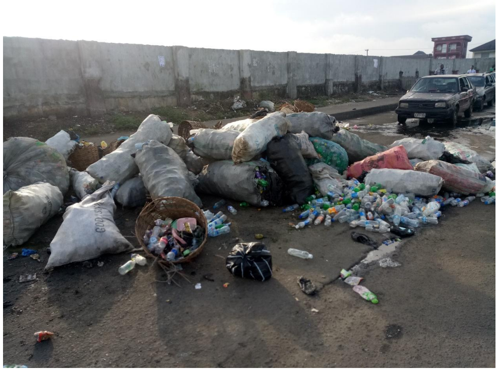
Fig 6. Some Bagged Refuse Flowing Out by the Mile 3 Market, Port Harcourt. 2019