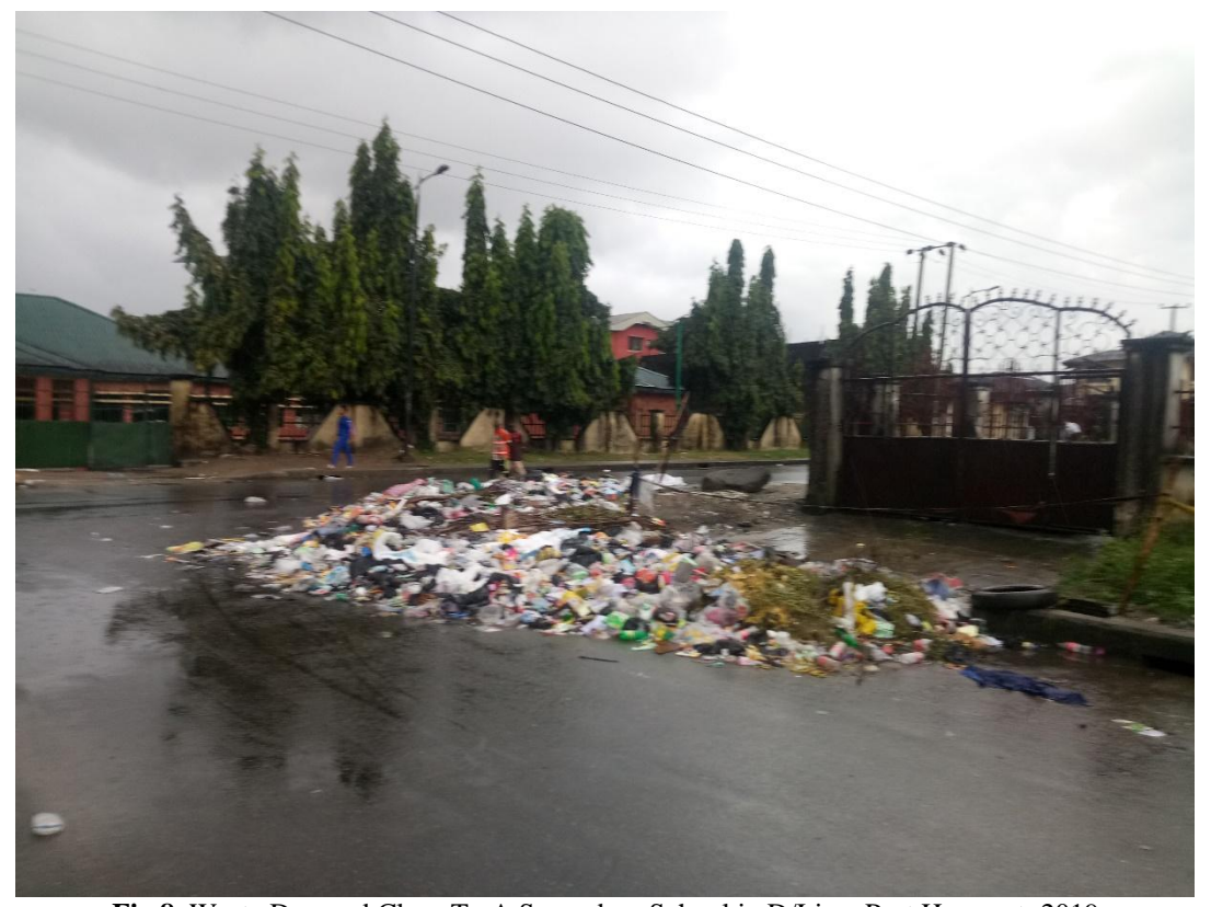
Fig 8. Waste Dumped Close To A Secondary School in D/Line, Port Harcourt, 2019

Diseases thrive in such conditions as in Figures 7 and 8 when MSW is left open for hours, not bagged or put in receptacles, it attracts flies and other disease carrying agents.