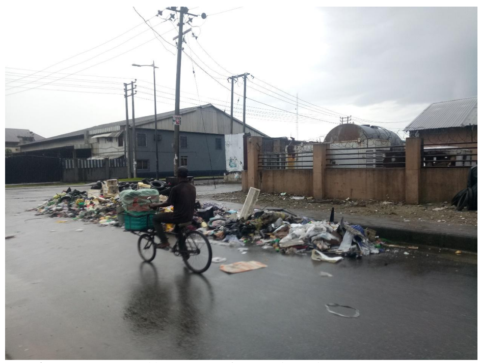
Fig 7. Waste Dumped by a Corner of a Street in D/Line, Port Harcourt. 2019

When MSW is dumped at the various collection points, the collection trucks do not pick them up till very late hours of the night and even into the early hours of the morning. At festive period like the Christmas, MSW may not be picked up, sometimes for days (Figure 7). And because Port Harcourt climate is somewhat peculiar most parts of the year, including heavy rainfall of about 233 - 327mm per month, Wind Speed of 8 - 56km/h, Relative Humidity of 89% and Temperatures of 22^{0} C to 36^{0} C; the waste most of the time is soaked with water and decompose within a short period of time resulting in a bad stench and indeed an odour nuisance all over the city which is unhealthy to for the inhabitant to breath.