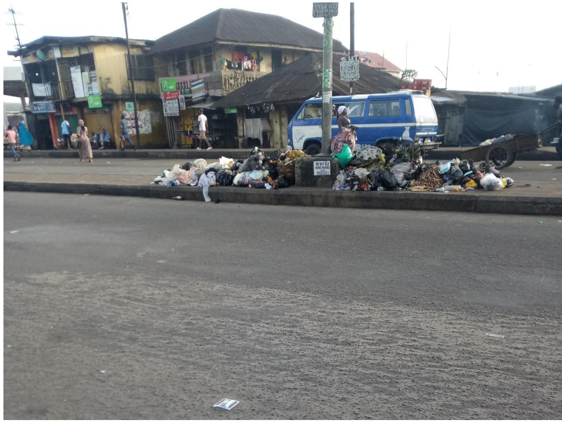
Fig 3. Waste Dumped on the Median of the Road along Ikwerre Road, Port Harcourt.