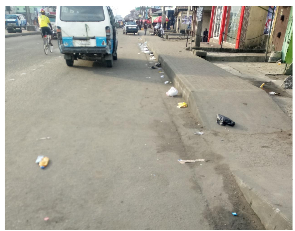
Fig 5. Waste Being Scattered by Wind All Over the Street along Ikwerre Road, Port Harcourt. 2019

A consequence of having all kinds of waste collection points is flooding in different parts of the city immediately after every rain fall. Greater Port Harcourt has experienced a lot of flash flooding in recent times, after rains, as a result of debris carried in and around the waste collection points carried by runoff water that clogs the water channels to the outlets. From the study, the respondents who throw their waste into Rivers and Water Bodies is as much as 6.5%, while 1.3% throw their waste into the Drains/Gutters(Table 2). In most environments and especially in the evenings, when the atmosphere is somewhat windy, waste is blown-away all over the place by the wind and many eventually end up in the drainages (Figures 5 and 6).