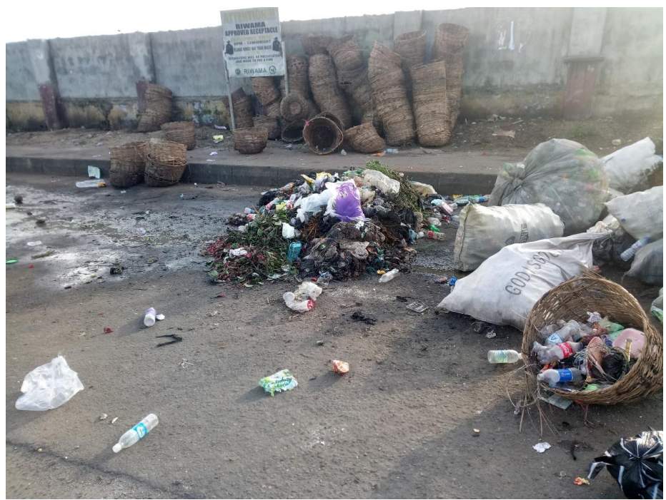
Fig 4. Approved Riwama Dump Site by the Mile 3 Park, Port Harcourt. 2019