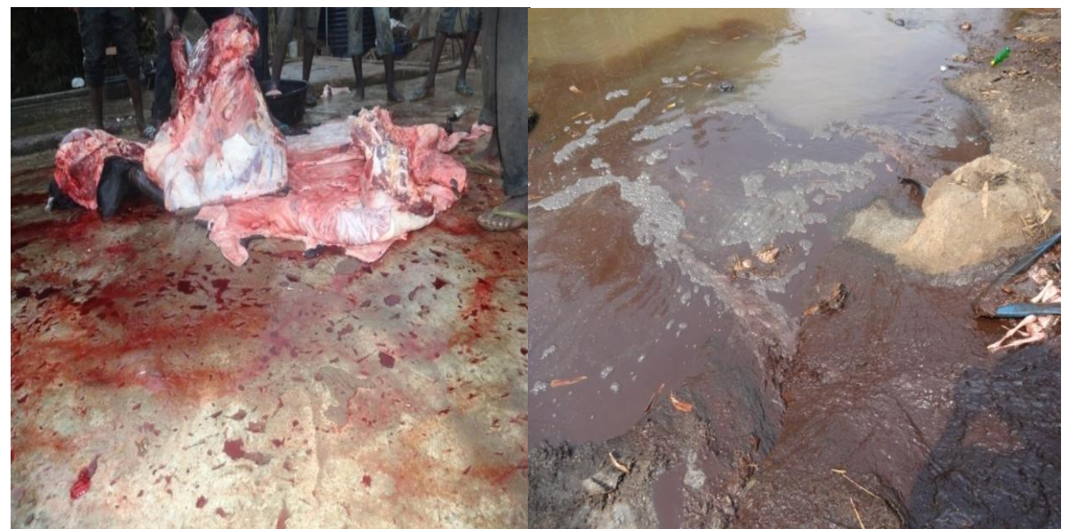
Plate1: Animal slaughtering

The study area is the New Artisan Market in Enugu North L.G.A, Enugu state, Nigeria. It has two public abattoirs where similar operations are carried out. The difference being that while one mainly slaughters cows while the other is mainly goat. However, there are no differences in the technique employed. The first abattoir is located on Latitudes 6^{\circ}27^{'}15.90^{''}N and Longitudes 7^{\circ}32'30.6''E . The second is located at Latitudes 6^{\circ}27'08.26''N and Longitudes 7^{\circ}32'33.58''E . Abattoir operations in the study area include slaughtering of animals (plate 1), washing of the slaughtered animals and channeling of wash water untreated into the streams (plate 2). Meanwhile, a community downstream makes use of the water for domestic purposes.