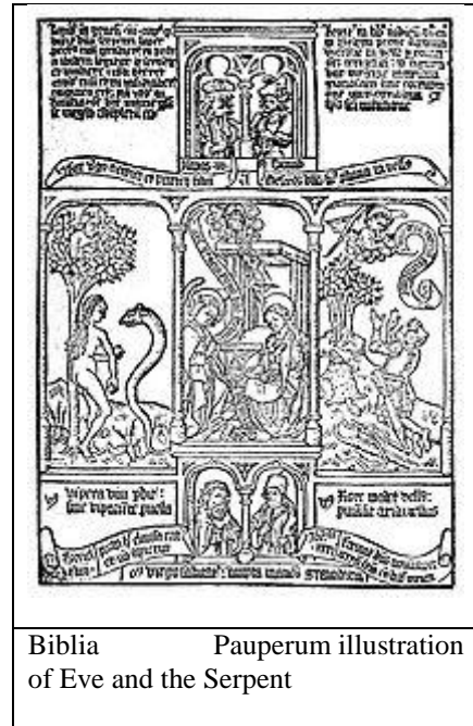
Biblia Pauperum illustration of Eve and the Serpent