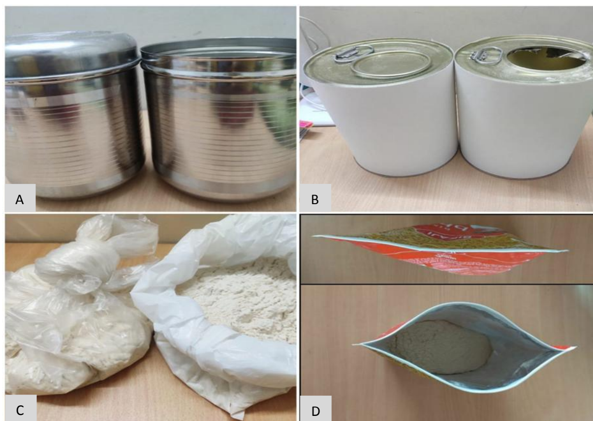
Figure 4 . (A) SCC& SCO, (B) ICC& ICO, (C) PBO& PBC AND (D) PCC & PCO.

Statistical analysis: All results were analyzed using One Way ANOVA Test followed by multiple comparison with GraphPad Prism 8 software. Significance was determined at p < 0.05 for all analyses.