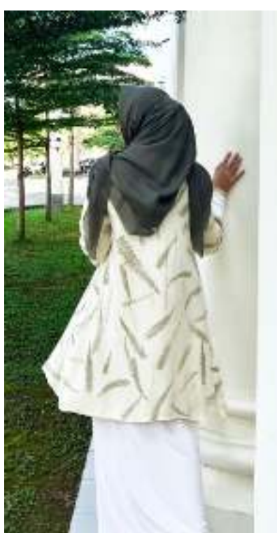
Figure 6. Outer model product results (first look back)