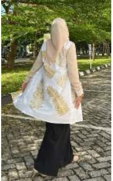
Figure 10. Outer model product results (both rear view)

Textile dyeing using the ecoprint technique cannot always produce the same colors and motifs as the previous results, even though it uses the same method and dosage. Widyasti, et. al. (2017) stated that the colors produced in natural coloring are inconsistent and not standardized. Inconsistent colors can be caused by non-standardized raw materials such as the age of the leaves used, the parts of the leaves used, and the origins of the leaves used.