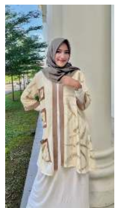
Figure 5. Outer model product result (first look at the front)

The following are the results of the outer product with the application of ecoprint using the steam method on the first model and the tap method on the second model.