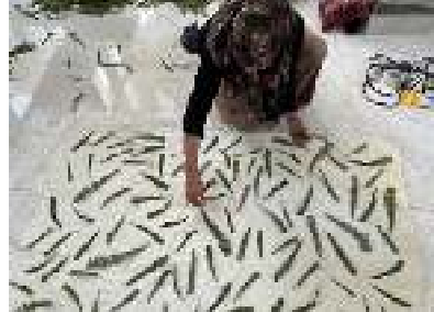
Figure 4. The process of arranging leaves

4. Then the leaves are arranged on the surface of the cloth as desired.