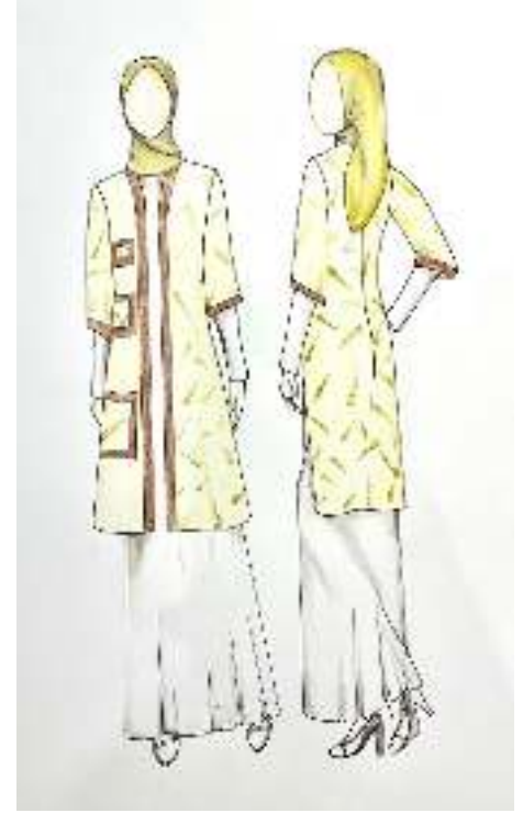
Figure 2. Outer product design on application steam method ecoprint

Designing ready-to-wear fashion products, the first outer model design is an outer model with <sup>3</sup>/<sub>4</sub> sleeves with les on the ends of the sleeves and a single collar using brown material, the right front is varied with 3 patch pockets of different sizes, this design model is used for outer product which is applied with eoprint method steaming.