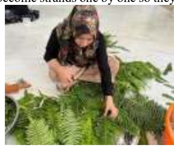
Figure 2. The process of selecting leaves

2. While waiting for the cloth to be soaked, choose the leaves that will be used in the ecoprint process, cut the leaves from the stems so that they become strands one by one so they can be arranged in a spread out manner.