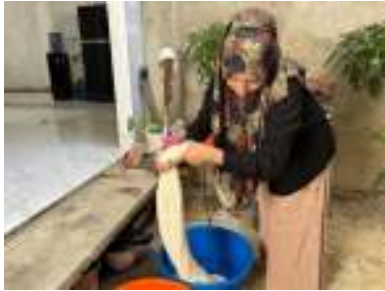
Figure 3. Fabric squeezing process

3. Next, squeeze the cloth that has been soaked until the water content is reduced to half dry, then spread the cloth covered with clear plastic.