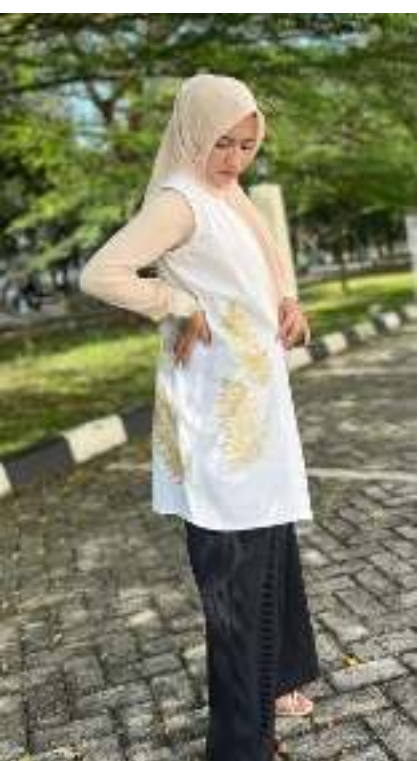
Figure 8. Outer model product results (both side view)