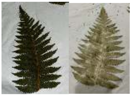
Figure 1. Leaves and motifs after tapping

5. Next, let the leaves that have been tapped for 10 minutes so that the color on the leaves seeps into the cloth, then clean the remaining leaves from the surface of the cloth.