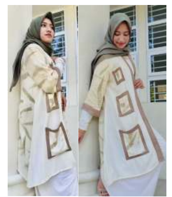
Figure 7. Outer model product results (first side view)

The results of the product using the tap method produce a color that is brownish green, even after fixation the color changes to golden brown and there are parts that fade.