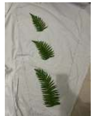
Figure 10. The process of laying the leaves according to the motif design

4. Then tap the leaves with a hammer and try to knock the leaves perfectly on the surface of the cloth to get good results.