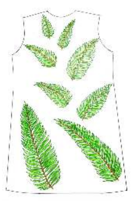
Figure 16. Pattern design on the back