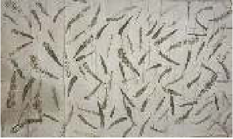
Figure 8. Ecoprint on the main fabric

mangrove bark and brown blankets with only yellow leaf shadows and the green color does not change after fixation using alum, it's just that the brown blanket turns a little brighter.