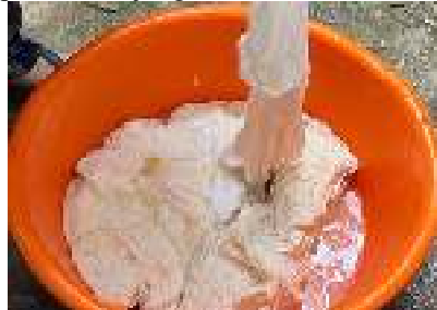
Figure 1. Mordanting process

1. White rayon cloth that has been scoured is soaked with alum solution added with tunjung at the rate of 10 tablespoons of alum and 1 tablespoon of tunjung with 3 liters of water for 30 minutes.