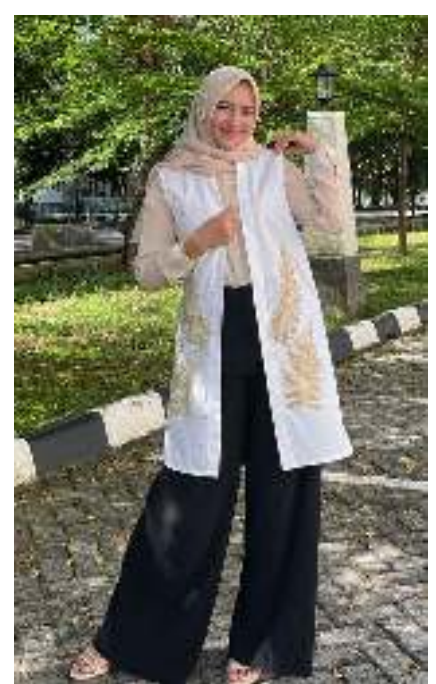
Figure 9. Outer model product results (both front view)