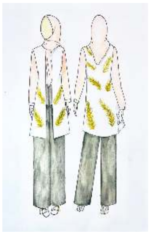
Figure 3. Outer design on the application product tap method ecoprint