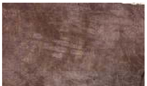
Figure 9. Ecoprint on blanket fabric