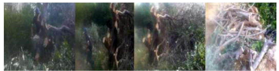
Figure 3 : a Syrian was busted by our camera while illegal felling trees in Minieh near an informal tent settlement.

Informal tented settlements are changing land use and mostly transform agricultural areas or with large agricultural trends into tents zones. In further, there is a high impact on forest resources which are close to their settlements. Syrian refugees are benefiting from the absence of laws application in Lebanon by illegal felling of forest without any fear from being captured and are using it as an alternative energy source especially in winter season (Figure 3).