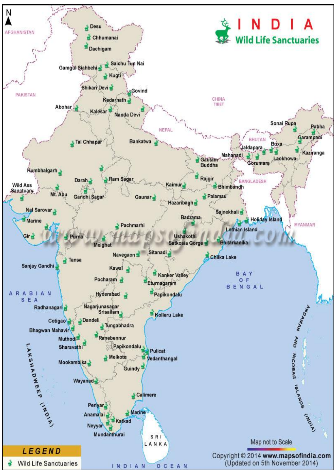
Map.1: Map showing wildlife sanctuaries in India