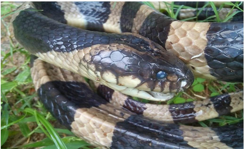
Fig.1&2: Banded Krait (Bungarus Fasciatus) In Etturnagaram Wildlife Sanctuary