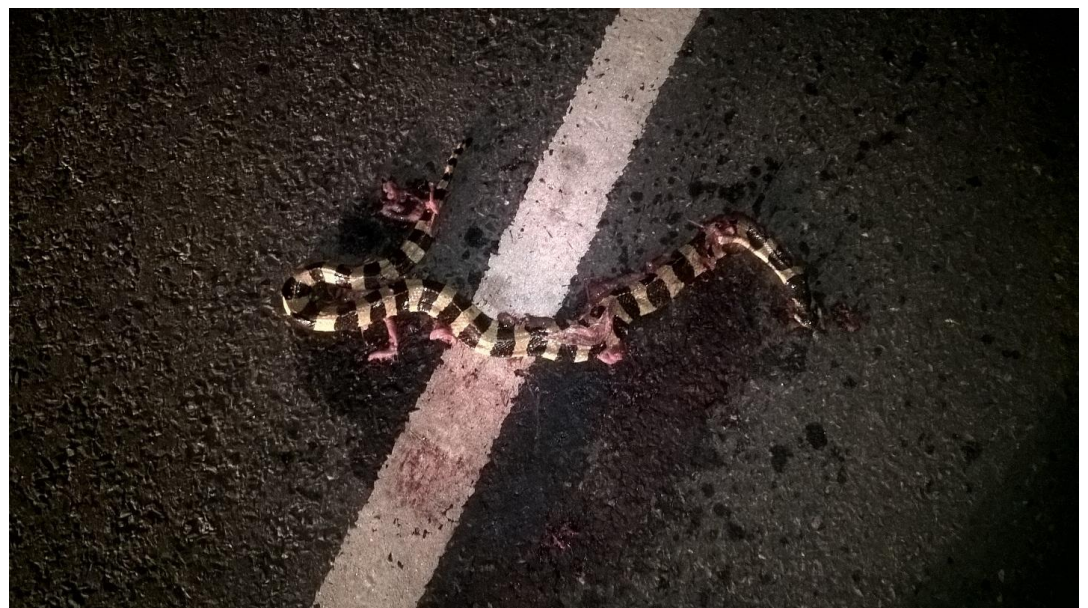
Fig.3: Banded Krait ( Bungarus Fasciatus ) found dead in Road Accident In Etturnagaram Wildlife Sanctuary (Etturnagaram –Kamalapuram Road)