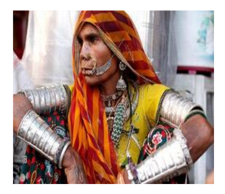
Figure –7. Rajasthani Banjara Tribal Woman, Wearing their Ethnic Jewellery.