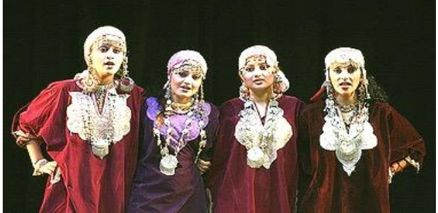
Figure – 6 Silver Amulet of West Bengal.