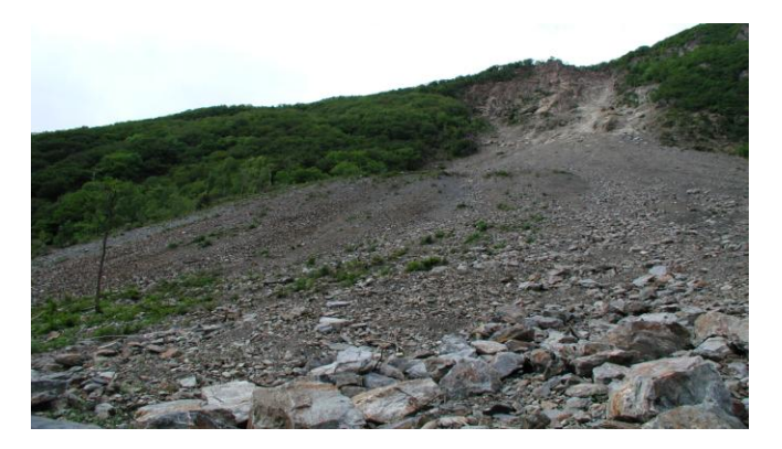
Plate 3.3: Rock fall in Kittony Area

Rock Falls are abrupt movements of masses of geologic materials, such as rocks and boulders that become detached from steep slopes or cliffs. Along the road in Kittony, Separation occurred along joints, and bedding planes. The movement was by free-fall and rolling for 15m blocking the highway. They are influenced by gravity, mechanical weathering, and the presence of interstitial water. It also occurred in Chesikaki area on the slope of Mt Elgon in 1997 where 100m<sup>2</sup> boulders hit the ground and swept an area of 36000m<sup>2</sup> after heavy precipitation (Masibo, 1998).