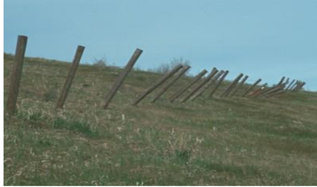
Plate 3.4: Soil creep in Kittony Area