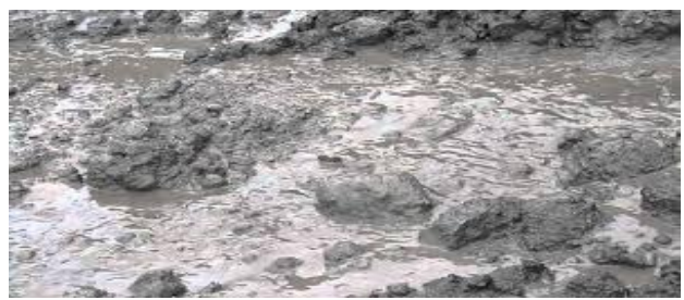
Plate 3.2: Mudflow in Kittony Area

A mudflow is an earth flow consisting of material that is wet enough to flow rapidly and that contains at least 50 percent sand, silt, and clay sized particles (Linuzela 2006). This occurred in Kerio Valley, Kittony village where the mud killed 11 people and covered thousands of animals and structures on March 2011. In 2012, 16 people, among them three children, died in Kocholwo, Simit, Kapsokom, Kaptarkom and Toroplongon areas of the Elgeyo escarpment after heavy rains pounded the region. The tragedy preceded another in Marakwet East where 14 people in Kittony village were killed by massive landslides in 2010. Reports in the area indicate that more than 60 people have been killed due to landslides since the 1997 El Nino rains, with geologists declaring the Elgeyo Escarpment unfit for human settlement.