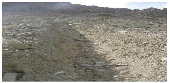
Plate 3.5: Debris flow in Kittony Area

A debris flow is a form of rapid mass movement in which a combination of loose soil, rock, organic matter, air, and water mobilizes as a slurry that flows downslope. Debris flows include <50% fines. Debris flows are commonly caused by intense surface-water flow, due to heavy precipitation that erodes and mobilizes loose soil or rock on steep slopes. Debris flows also commonly mobilize from other types of landslides that occur on steep slopes, are nearly saturated, and consist of a large proportion of silt- and sand-sized material. Debris-flow source areas are often associated with steep gullies, and debris-flow deposits are usually indicated by the presence of debris fans at the mouths of gullies. Fires that denude slopes of vegetation intensify the susceptibility of slopes to debris flows.