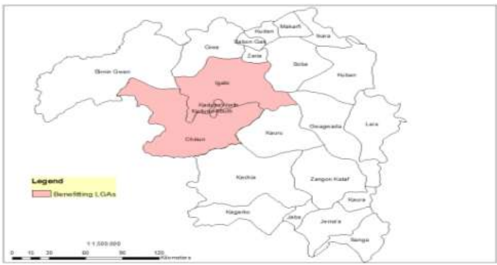
Figure 1: Map of Kaduna State of Nigeria Showing Benefitting Areas

For the purpose of this study, Kaduna metropolis was divided into three zones, namely north, south and central. Nineteen (19) soil samples which comprised of six from south and central zones and seven from north zone were collected underneath the landfills within 0-30cm depth from the ground surface. Samples were prepared, digested, filtered and diluted to obtain stock sample solutions which were used to analyze twenty (20) hydrochemical parameters, namely pH, electrical conductivity, total dissolved solids, alkalinity, acidity, total hardness, carbonate, bicarbonate, biochemical oxygen demand (BOD), chemical oxygen demand (COD), chloride, nitrate, sulphate, iron, calcium, magnesium, manganese, chromium, sodium and potassium. Another set of soil samples were taken from points adjacent to the waste dumpsites where soil samples were taken, with the aim of comparison and determining the extent to which municipal wastes have influenced soil characteristics, and only six parameters were tested, which are pH, electrical conductivity, calcium, magnesium, sodium and potassium.