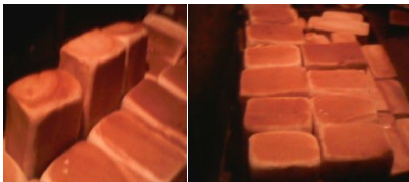
Sample B – 25/75