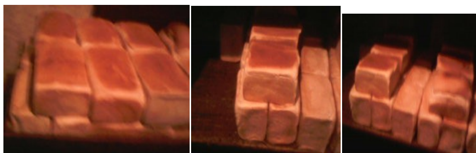
Sample B – 100/0