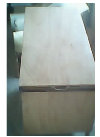
Fig. 1.2 Solar Oven