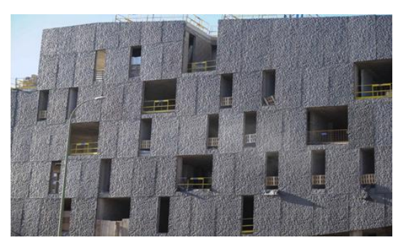
Figure 3: (Left) stone exterior cladding (ArchiExpo, 2014); (Right) textured concrete exterior cladding (Architectonic Concrete, S.L., 2011)

Stone is a little bit limited with the white colour and its grades, whereas colorants can be added to concrete to change its grey colour. Stone has the most elegant look of all materials, its unique protrusions creates this prestigious appearance (Gerns, 2002).