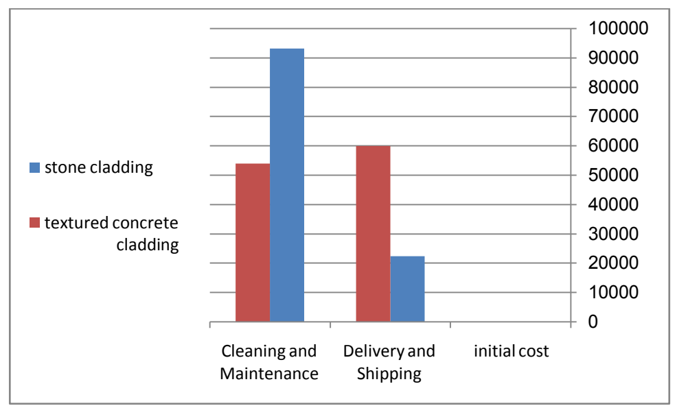
Figure 1: the variations in costs for the stone and textured concrete cladding (Alibaba, 2014)